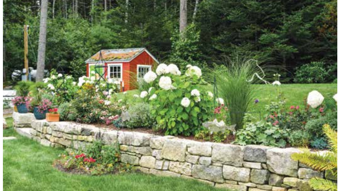
TOP, LEFT: The cheeky sign on the dock came with the house. "Jim keeps waiting for the 'fancy women' to sign in," Chris jokes. TOP, RIGHT: Bunk room floors are done over in gray floor paint. MIDDLE, LEFT: The couple commissioned the still life from Colin Page: "The small blue vase in the painting is from Chris's grandmother's cabin in western Maine." MIDDLE, RIGHT: Kids are encouraged to spend days out of doors. LEFT: The garden wall is by Norton Stoneworks. (OPPOSITE) BOTTOM LEFT: Cooloff dips are never far away. BOTTOM RIGHT: A bedroom has hints of nautical red.