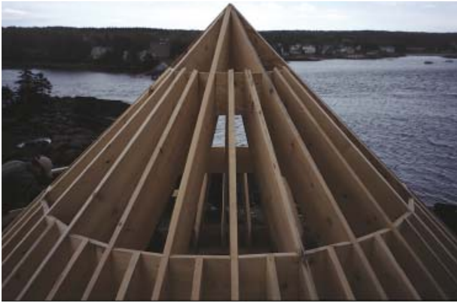
Figure 1. Accurate framing is critical for a good-looking curved trim job. In this case, the rafter tails lined up to within \frac{1}{8} inch, measured from the plate. The curved plates were built up from four layers of \frac{3}{4} -inch plywood, glued and screwed together.