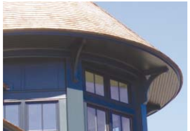
Figure 2. The home's original design called for curved sash, but the custom windows proved too expensive. Instead, the walls of the tower were framed like an octagon, but with curved jamb extensions above and curved sills below to transition from flat to round. Wide pilasters at each corner of the octagon separate the windows and receive decorative brackets at the top.