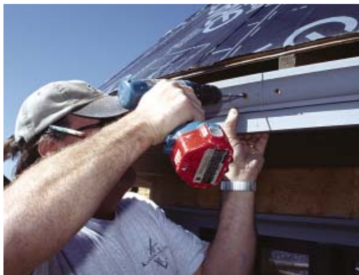
Figure 5. The crew positioned the crown molding so its top edge would be covered by the copper drip edge (top left). Quick-adjusting bar clamps kept the crown tight to the fascia while it was fastened (top right). To avoid gaps caused by seasonal movement, the carpenters used scarf joints. The cuts were spot-primed and the joints sealed with a healthy dose of caulking (above left), then fastened with stainless screws (above right).

spot-primed where needed as we went along. Spot-priming is important because it keeps the wood from weathering, which could prevent good adhesion of the top coat.