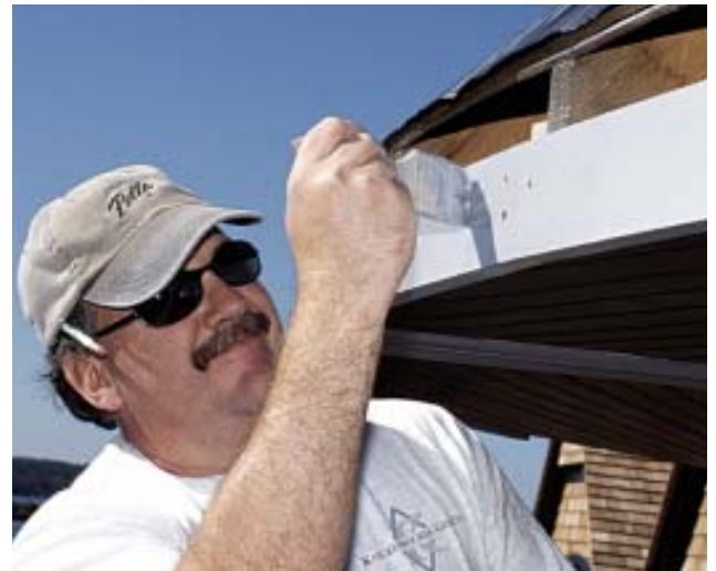
Figure 4. The trim was initially cut at the roof's pitch, then scribed for a closer fit with cedar shingles (top left). After installation (top right), the carpenters fine-tuned the joints with a random-orbit sander (left), then primed nail and screw holes to prevent weathering (above). The painter would later fill the holes with auto-body compound.