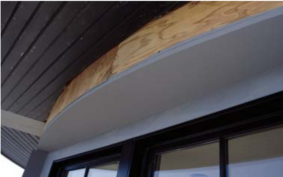
Figure 6. The curved window jamb extensions (left) were installed slightly proud so they would disappear into the dado on the back of the curved frieze (below left). A bed molding hides the gap at the top of the frieze while the applied bead (below) adds visual interest.