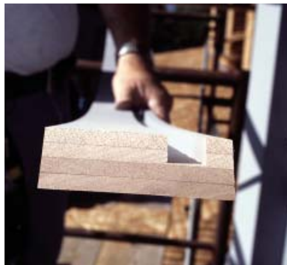
Figure 3. To produce the curved fascia, the crew first installed the T&G soffit (above), using a flexible straightedge held against the rafter tails to scribe the radius on the outer pieces. The soffit was then traced and the exact curve provided to the millwork shop. The curved fascia (above right), glued up from strips of Honduras mahogany, was made with a 1/2-inch-deep dado to accommodate any slight irregularities in the edge of the soffit. A stepladder allowed the cut man to reproduce the trim's installed position at the saw (right).