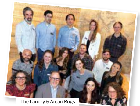
The Landry & Arcari Rugs and Carpeting team