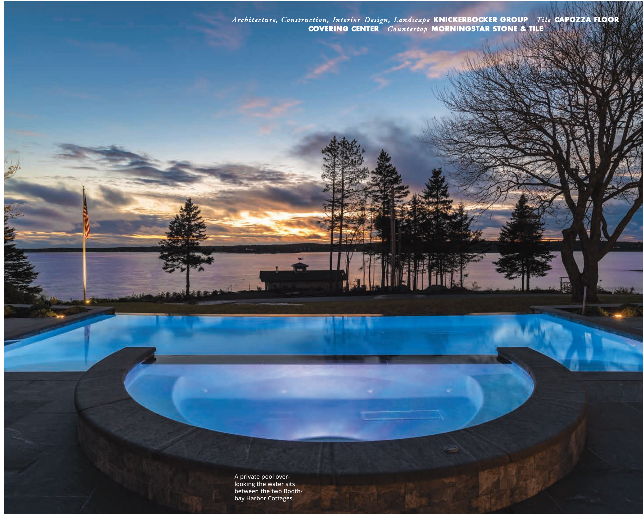
A private pool overlooking the water sits between the two Boothbay Harbor Cottages.

Architecture, Construction, Interior Design, Landscape KNICKERBOCKER GROUP Tile CAPOZZA FLOOR COVERING CENTER Countertop MORNINGSTAR STONE & TILE