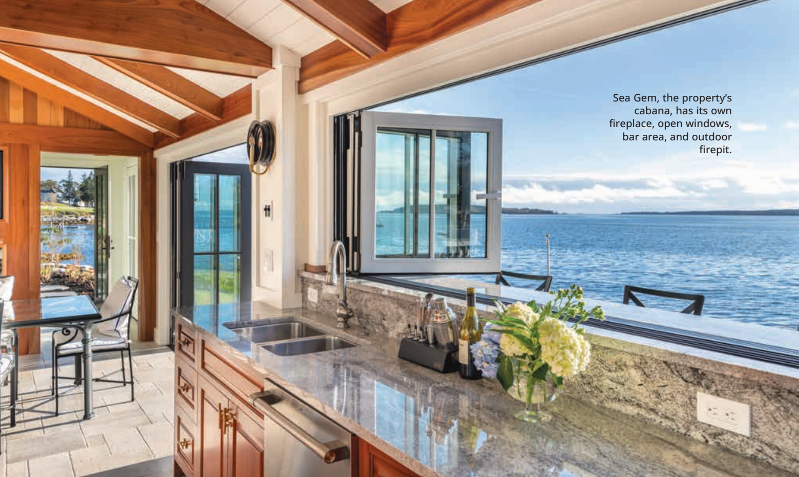
Sea Gem, the property's cabana, has its own fireplace, open windows, bar area, and outdoor firepit.