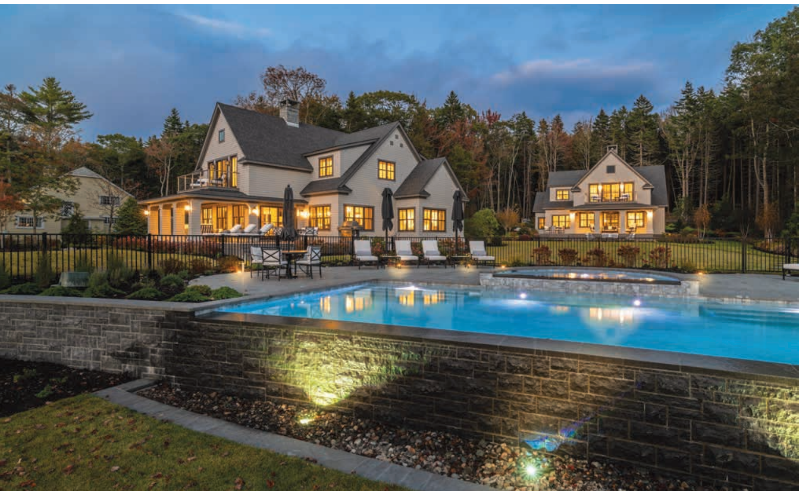
BELOW: Both cottages are available to rent, either by the same party or separate. The landscape creates privacy between the two buildings, divided by the pool. (OPPOSITE) TOP: There are multiple outdoor seating areas throughout the property to enjoy a peaceful sunset over the water. BOTTOM: Knickerbocker Group designed the homes, landscapes, and interiors with a traditional, coastal feel.